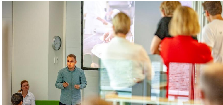
Knowledge and competences