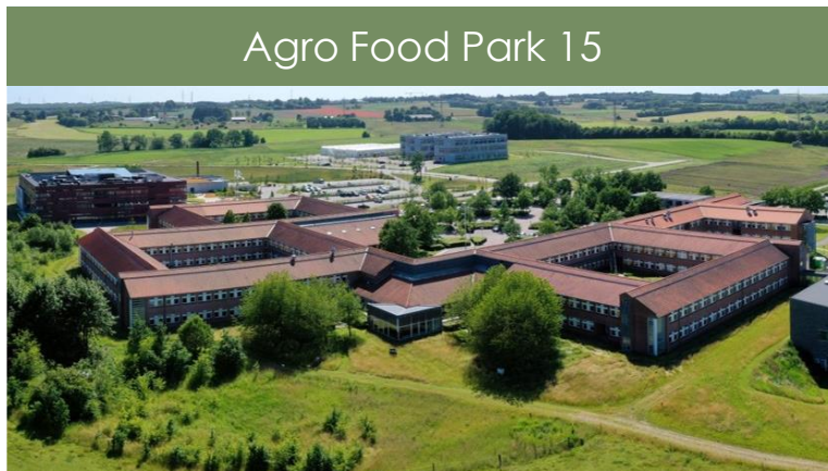
Agro Food Park 15