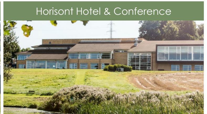
Horisont Hotel & Conference