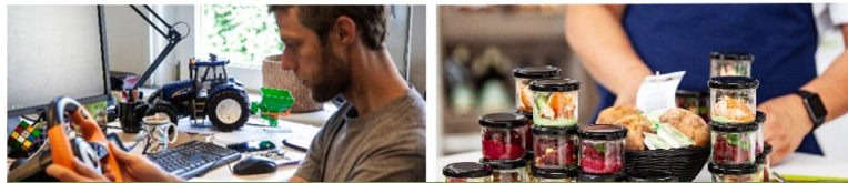
Exclusive for Agro and Food