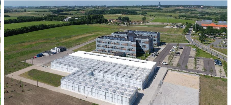
Aarhus University Dept. of Food Science