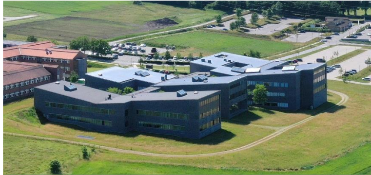
Agro Food Park 13